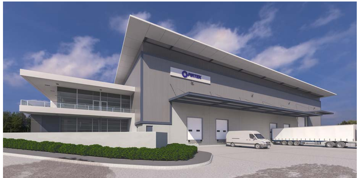
New Pirtek South African National Office Waterfall City – Johannesburg, South Africa

Today, Pirtek is the world's leading supplier of premium fluid transfer solutions.