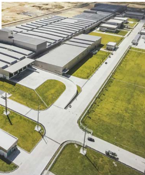
Bridgestone Rayong Plant